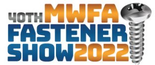
Table Top Show

The Mid-West Fastener Association will host their 40th Fastener Show on August 23rd, 2022. The show will be a Table Top Show. Fastener suppliers are invited to showcase their products and other services at this one-day show.